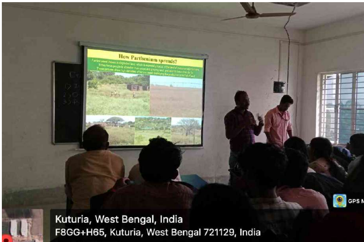
Kuturia, West Bengal, India F8GG+H65, Kuturia, West Bengal 721129, India