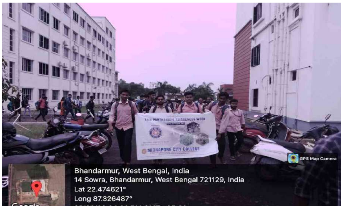
Bhandarmur, West Bengal, India 14 Sowra, Bhandarmur, West Bengal 721129, India Lat 22.474621° Long 87.326487° 25/08/23 04:39 PM GMT +05:30