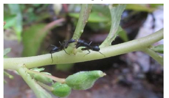
FIGURE 9: The liquid fluid exchange between two ants in Impatiens balsamia .