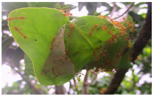
FIGURE 6: The hemiparasitic( Lorenthus longifolia ) leaf domatia.

The three main nutrient classes in plant-derived cellular ant rewards. Ant-acacias (also called "swollen thron"