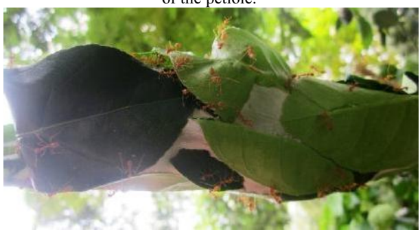
FIGURE 17: The workers ants produced the nest using larval silk in Citrus sp.