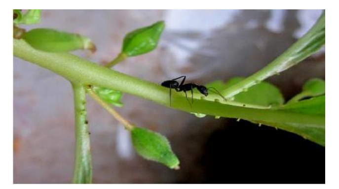
FIGURE 8: The ant collected liquid from extra floral nectari gland. (Mutualistic relationship between plant & animals).