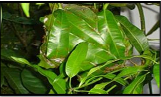
FIGURE 4: The ants nest in Mangifera indica.