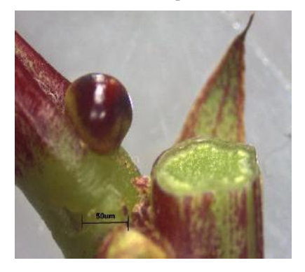
FIGURE 11 : Sterozoom microscopic picture of EFN of Cassia occidentalis ; EFN on petiole.