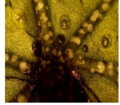
FIGURE 13: Sterozoom microscopic picture of EFN of Coccina sp ; EFN on lower part of the leaf.

Nectar is an aqueous solution of substances that mainly comprise primary metabolites such as sugars and amino acids and generally serves the attraction of mutualistic animals to the plants (Fig-8) (Baker and Baker 1975; Baker et al. , 1978).The ant collect liquid from the EFN gland and sometimes these ant species exchange liquid