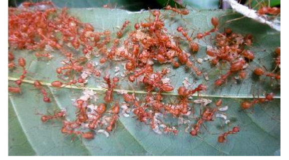
FIGURE 19: Ants feeding the storage food inside the leaf domatia.

in eastern North America (Rico-Gray & Oliveira, 2007). Both the plant and the ant benefit in this scenario. The ants are provided with an elaiosome, a detachable food body