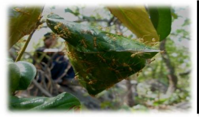
FIGURE 3: The building up leaf domatia in Shorea robusta.