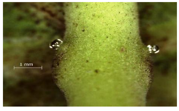
FIGURE 15: Sterozoom microscopic picture of EFN of Ipomea cornia ; secretion the liquid from EFN on two sides of the petiole.

The effectiveness of ants as pollinators was analyzed by assessing (1) their quantitative importance at flowers; (2) there effect on host plant seed production; (3) their effect on the performance of the host plant progeny, estimated as seed germination, seedling emergence, seedling survival to flowering. The ant species producing significantly more seeds than flowers visited by only winged insects did not differ from self-pollination. Ant-pollinated flowers produced seeds with a germination rate comparable to the other treatments. Moreover, seedlings from these seeds emerged as fast, and survived at the same rate as controls.