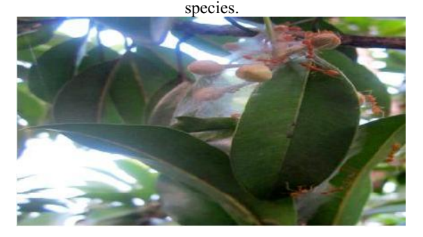
FIGURE 18: The workers ant construct nest by weaving together leaves and flower in Manikara sp. Myrmecochory, literally translated as "ant-dispersal," is

the collection and dispersal of seeds by ants. Ants disperse more than 30% of the spring-flowering herbaceous plants