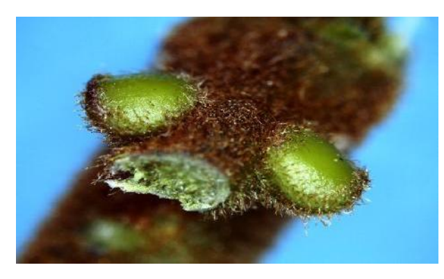
FIGURE 14: Sterozoom microscopic picture of EFN of Passiflora vitifelia; pair of EFN on petiole.

involved in pollination (Bentley, 1977; Koptur, 1992). The EFN in the species Ipomeapes-caprae belonging to the family Convolvulaceae. The plants have a pair of extra floral nectaries on the petiole of each leaf near the point of blade attachment, which produce nectar (Fig. 10). Red nectaries at the base of young leaves have been found to produce more nectar and attract ants and other visitors. The EFNs of I. pes-caprae were found to be visited by many foraging ants as well as many non ant visitors like beetles wasps, jumping spiders and flies. Ants visited the EFNs of I. pes-caprae on a round the clock basis patrolling the upper and the lower leaf surface and stem (Mondal et al. and Chakraborty, 2013). Also found EFNs in different plant species outside the flower, some examples of sterozoom microscopic picture of EFN of (a) Cassia occidentalis; EFN on petiole (b) Acacia catechu;