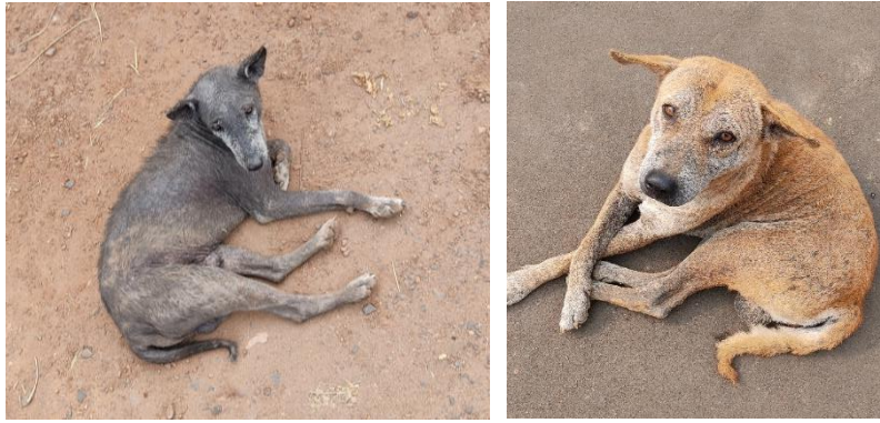
Figure 2: Stray dogs.