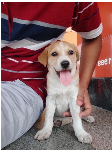
Figure 3: Human -Stray dog interaction.

Human-stray dog interaction in India is conditioned by cultural respect, sympathy, and occasionally conflict. Though numerous communities are actively concerned about stray dogs, dog bites, nuisance by barking, and feelings of threat to safety create negative attitudes. An understanding of these socio-cultural forces is important in planning management strategies through community participation. Ethnographic studies, programs based on community participation, and evaluation of grassroots interventions can provide for coexistence and, simultaneously, resolve issues of public safety (Patel et al., 2022) (Fig 3).