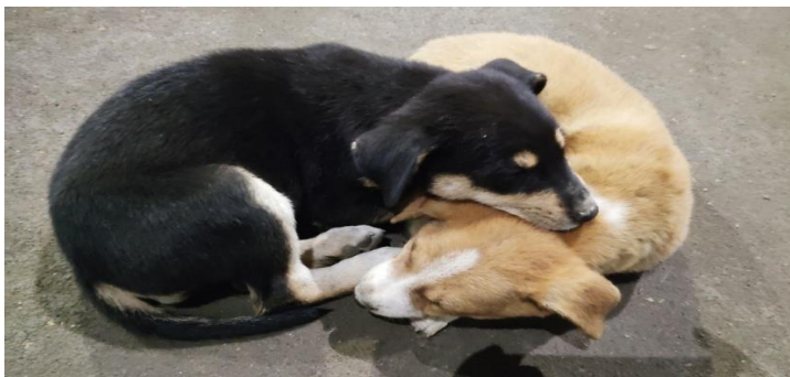
Figure 4: Puppies.

The Animal Birth Control (ABC) program remains India's most widespread method of controlling stray dogs. While substantial effectiveness is locally witnessed, overall performance is undermined by irregular use, uneven allocation of funds, and the absence of community involvement. Alternative strategies like community-based management and non-surgical sterilization offer possible channels. Comprehensive analyses of ABC schemes, studies into new sterilization types, and adaptive management techniques are needed for sustainable population regulation (PFA, 2021) (Fig 4).